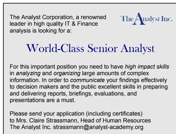
Typical Analyst Requirements

As shown in the sample job advertisement above, the course content will focus on key activities that are relevant for any analyst's daily work. The training program is organized by the Communication Faculty of the University of Lugano. The faculty conducts training and applied research in the analyst field and in the area of knowledge communication. Lecturers include professors from various universities.